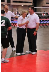
USA Volleyball National Clinic