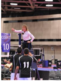
USA Volleyball National Clinic