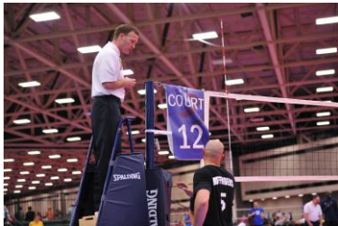
USA Volleyball National Clinic