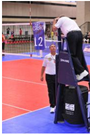
USA Volleyball National Clinic